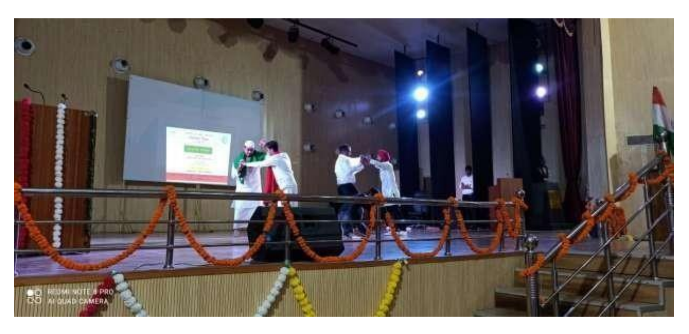
Skit performed for creating awareness among youth on freedom fighter and their personalities