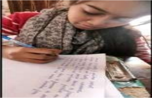
Online Participation of students for Debate and Essay competition during lockdown