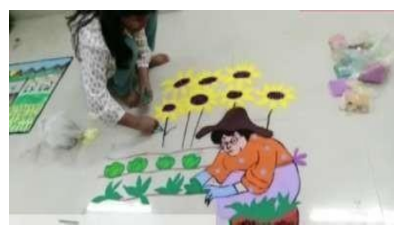
Rangoli Competition at Girls Hostel, 2023