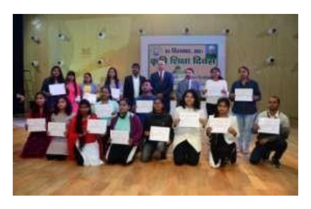
Certificates of Merit to Students on Agricultural Education Day -2021