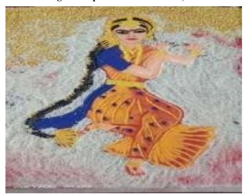
Rangoli made by university student with Grains and Colors in AGRI-UNI-FEST

Cultural Competitions During Lockdown : Students were even provided opportunity for the presentation of cultural events during COVID-19 lockdown in online mode. The students participated in: