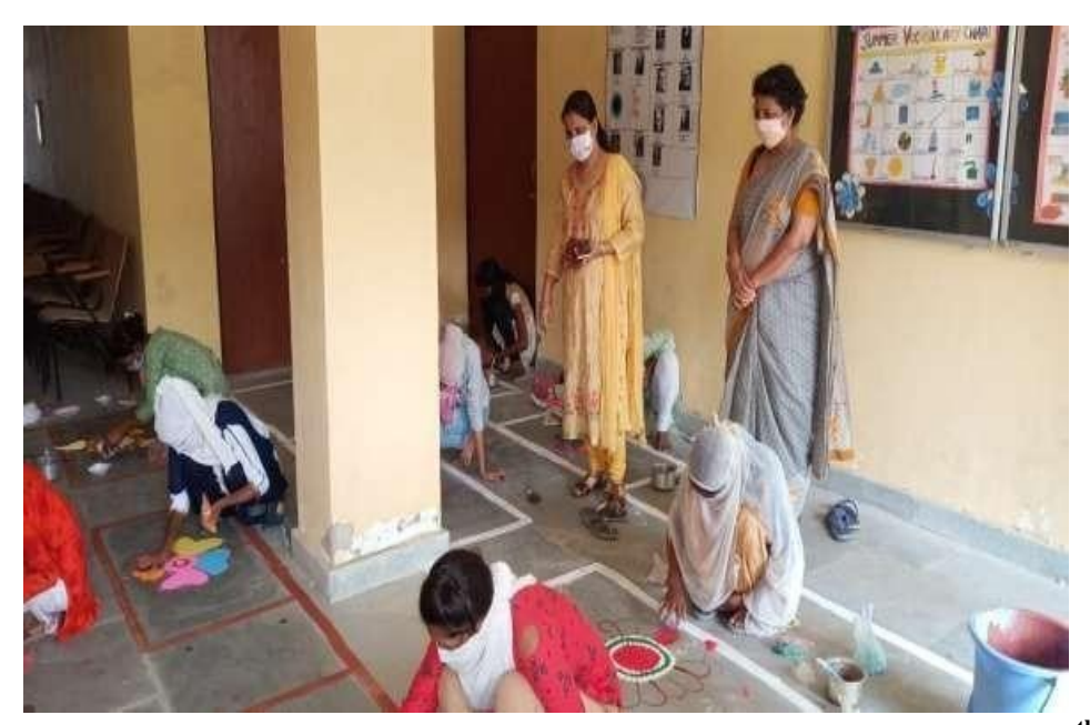
Rangoli Competition for the Daughter's of Farm Women October 15<sup>th</sup> 2020

Competitions organized for Community: various events were also organized for community like school children, adolescents and young girls and women-oriented programmes like Mother's Day Celebration, awareness programmes (Nukkad-Natak) on women rights, child health and hygiene, pregnant and lactating mother nutrition etc. Rangoli competitions for the daughters of farm women working in the university.