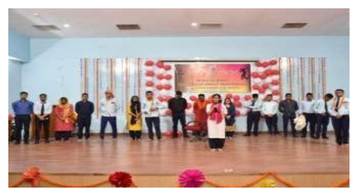
Freshers Party College of Horticulture

• Farewell Party: It is organized by the III<sup>rd</sup> year students to wish outgoing batch a warm farewell and bless them for bright future. All the faculty members with other students of the college participate in the cultural events to bring smile on the faces of their loving seniors and make the day memorable for the passing out batch.