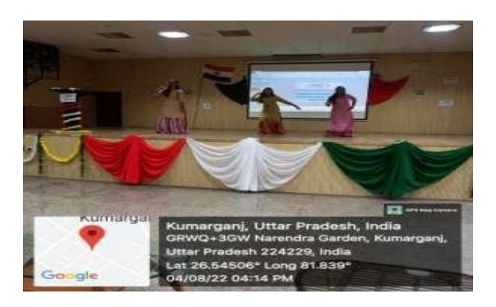
Group Dance to celebrate Azadi ka Amrit Mahotsav

Azadi ka Amrit Mahotsav: As per Government directions Azadi ka Amrit Mahotsav was celebrated in the university. Various competitions were organised at University Campus for the students to celebrate the free India and pay tribute to the freedom fighters of the country. Cultural events and Literary competitions were organized at college and university level.