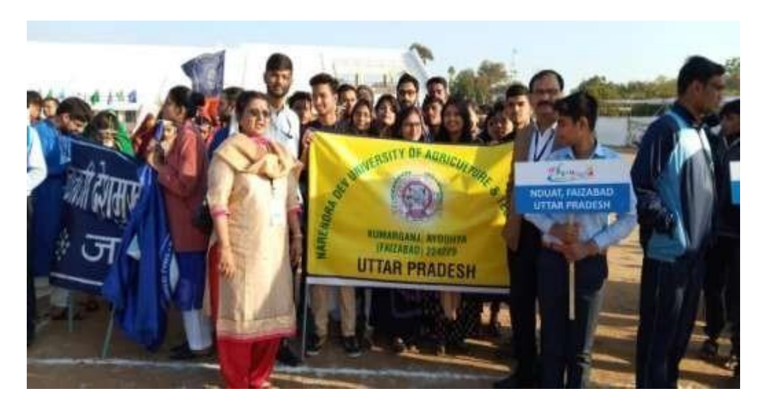
Team ANDUAT at 19<sup>th</sup> AGRIFEST 2018

Participation at National level functions and meet provide the students to get national level exposure to the cultural events and appreciate and respect the unity in diversity of culture in terms of performances, food, language, dressing, people and thoughts etc. Involvement of the students at National level allows them to visualize the intensity of cultural events and qualities of performances that master standards and inspire them to do better. During the last five years, the students of ANDUAT, participated in all the events at 21 AGRIUNIFEST. In 2018 the students of this university participated in 19<sup>th</sup> AGRI FEST held at Gujarat and one of the students obtained award in one of the events.