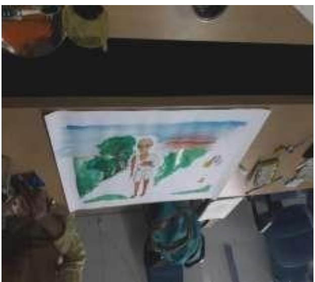
College Level Painting Competition on the Occasion of Gandhi Jayanti